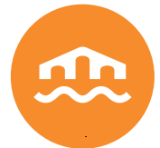
rec center nearby